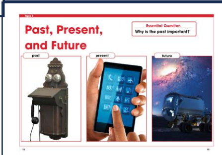
<u>Unit 7 - Pacing Guide</u>

L.1.6: Use words and phrases acquired through conversations, reading and being read to, and responding to texts, including using frequently occurring conjunctions to signal simple relationships.