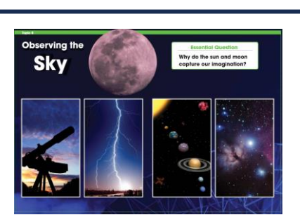
<u>Unit 8 - Pacing Guide</u>